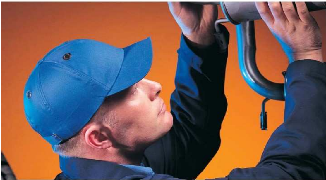
Baseball Bump Cap in Royal Blue