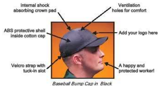
Baseball Bump Cap in Black

IMPORTANT NOTE: The Baseball Bump Cap can be used in environments where there is a risk of minor bumps or scrapes to the head. It is NOT to be used as an industrial safety helmet.